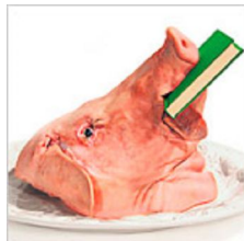
Mau-Mauing the Flesh Eaters