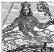
Room for Debate: Hobbes in Hebrew