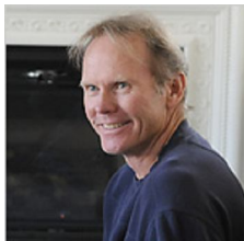
Law Seeks to Ban Misuse of Genetic Testing