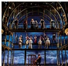
I Hear America Singing, in Syncopation