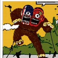
Niall Ferguson and Moritz Schularick: The Wallop